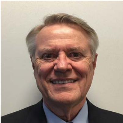
Commissioner GREGORY H. SIMPSON